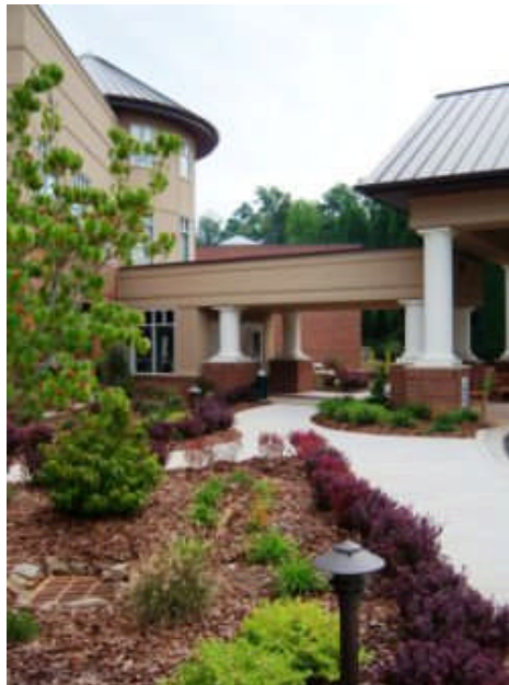
The front gardens and entrance