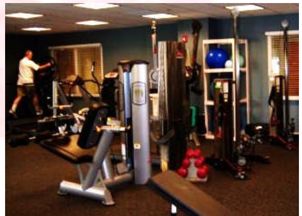
Expanded fitness center with new equipment