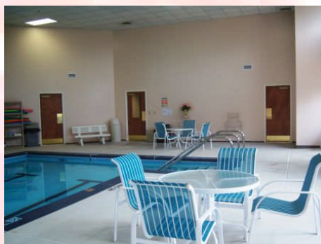
New poolside locker rooms

"The new library is wonderful! Much more inviting and welcoming in many ways. It's great."