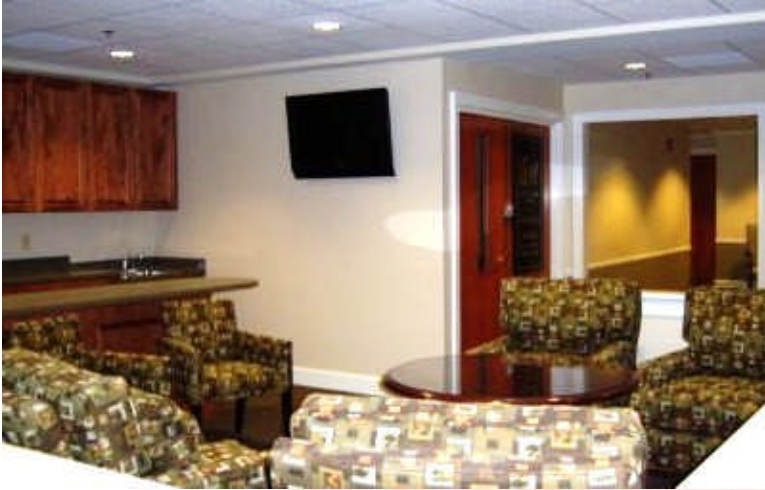
The Club Room with the doors to the expanded F&M Bank