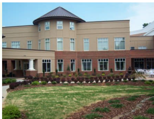
New grass, shrubs, plants at the main entrance

"Mary Fahey and I swim early in the morning—at 6:30 a.m. We are so happy to be back in the pool."