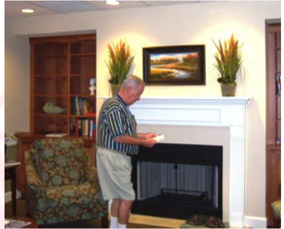
Relaxed waiting area near the front entrance

“I use the F&M branch for CDs. It is very convenient and Daisy (Carlene Fink) has been very helpful to me. Her advice saved me from incurring excessive penalties when I needed to cash in a CD.” Hugh Childers